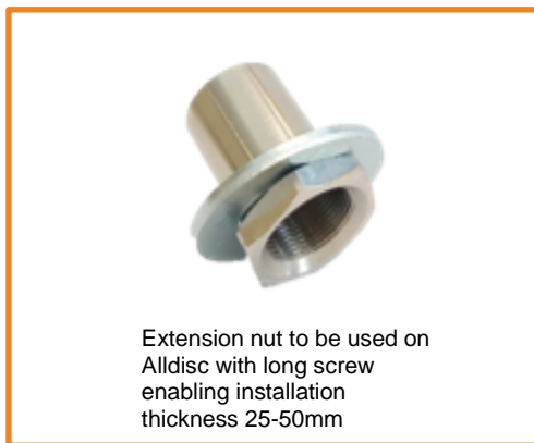
Extension nut to be used on Alldisc with long screw enabling installation thickness 25-50mm